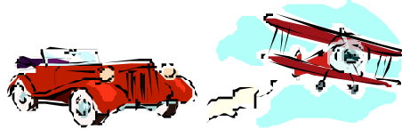
Get there any way you can

This year's annual meeting will be brand new; In a different month, in a new venue. So mark it on your calendar and plan to attend And don't forget to bring a friend.